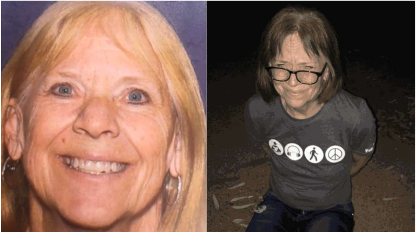
Tucson Police Department

TUCSON (KVOA) - The woman who prompted a nationwide manhunt after escaping custody in 2019 pleaded guilty in connection to the death of a Tucson man on Wednesday.