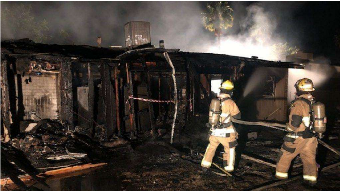
Tucson Fire Department responded to a home in 3500 block of S. Calexico Avenue on Tuesday, April 16, 2019.

At the time of the initial investigation, the owner of the home could not be located.