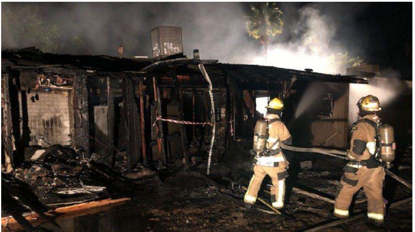
Tucson Fire Department responded to a home in 3500 block of S. Calexico Avenue on Tuesday, April 16, 2019.

Investigators say it is difficult to search the home because the foundation is unstable.