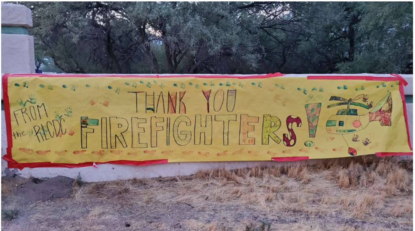
'Thank you, Firefighters' sign at Catalina State Park on Friday, June 26, 2020.

The Northern Rockies Incident Management Team is also keeping an eye on thunderstorms forecasted for Saturday in Cochise County.